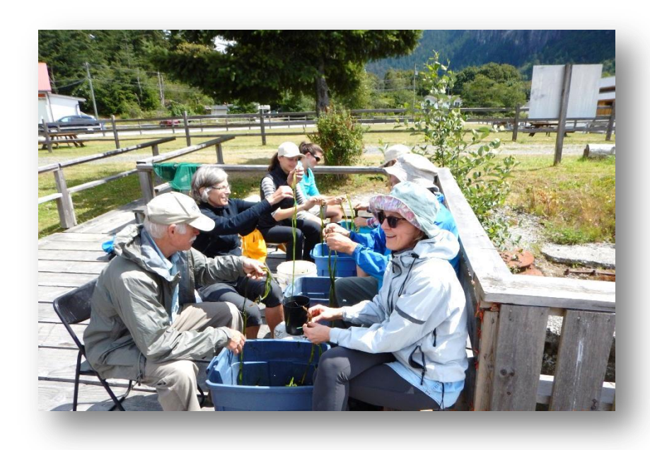
Volunteers in Squamish during an eelgrass transplant in July, 2017

Based on shoot density and area extent, 65% of the 23 transplant sites can be considered successful and 35% as failures. The majority of the transplants (17) were installed in degraded seabeds affected by logging storage, mining or cable placements.