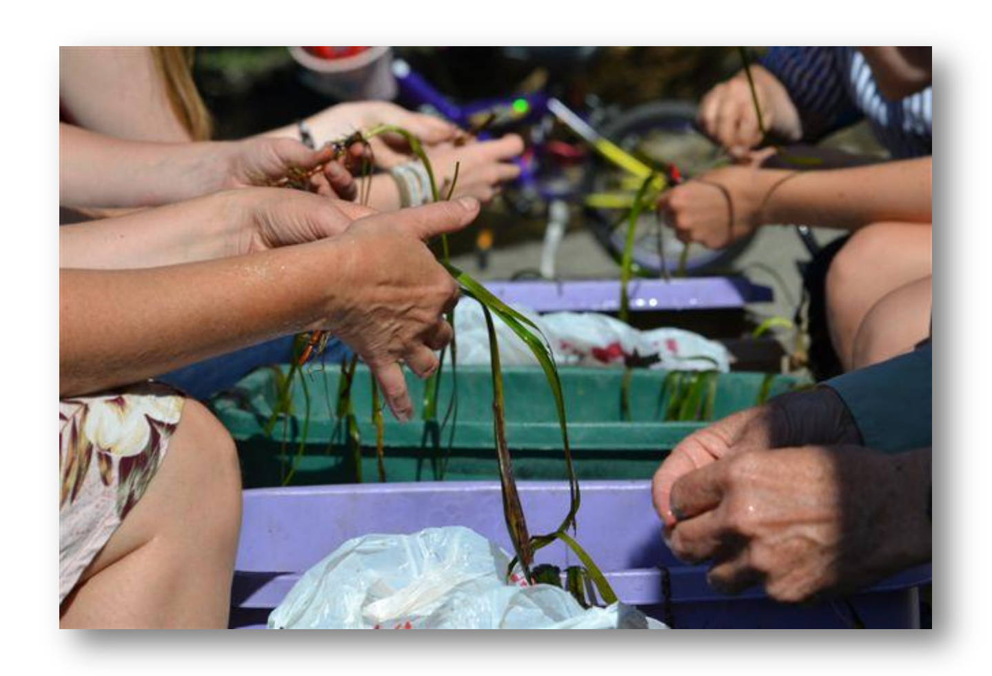
2016 – 2017 Annual Report www.seachangesociety.com