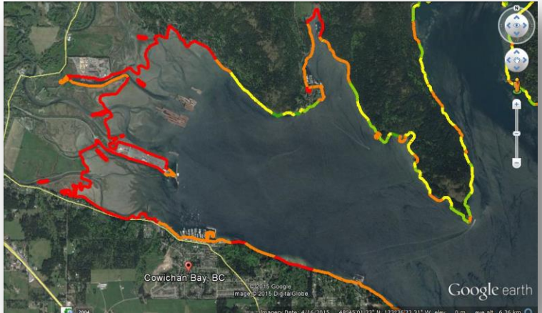
A map of shoreline sensitivity to sea level rise in the Cowichan Estuary, one of the many impacts challenging salmon in the watershed

Native eelgrass habitats ( Zostera marina ) were mapped by the SeaChange mapping crew in Cowichan Bay to further conservation and research in the estuary.