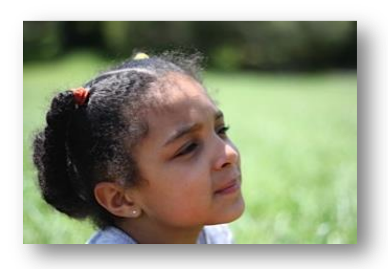
This report is dedicated to present and future earth stewards.