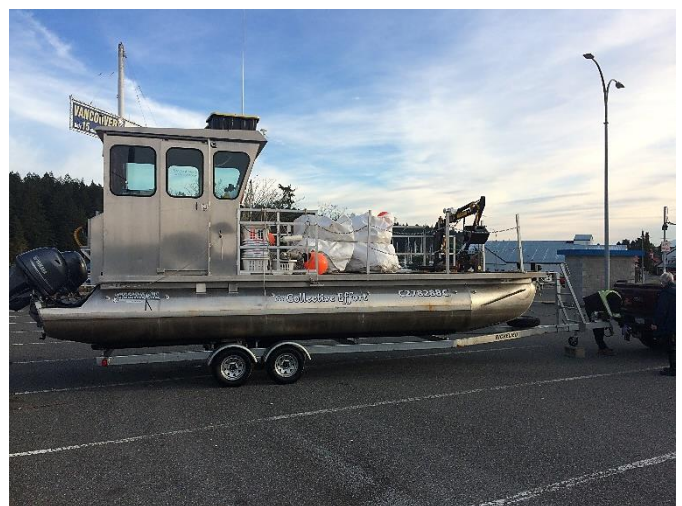
'Collective Effort' SeaChange Barge and Crane