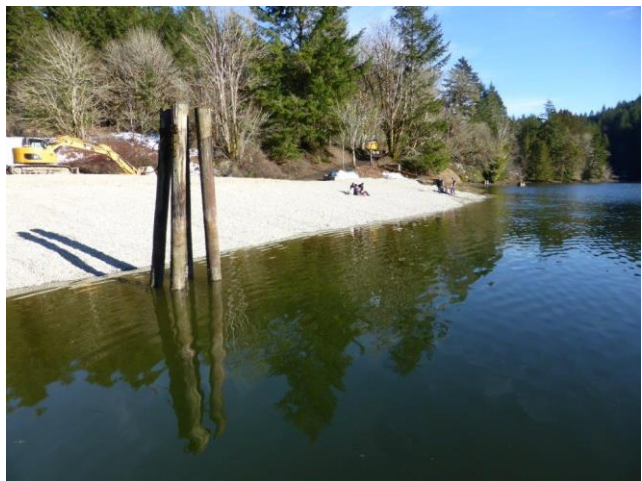
Before and After the Beach Enhancement (2017)